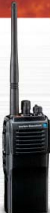
VX-921E 48 ch/3 groups without LCD