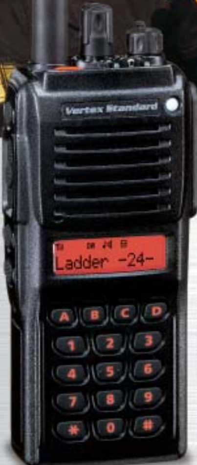
VX-929E 512 ch/32 groups with 16 Keys and LCD