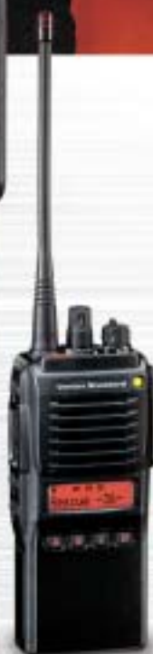
VX-924E 512 ch/32 groups with 4 Keys and LCD