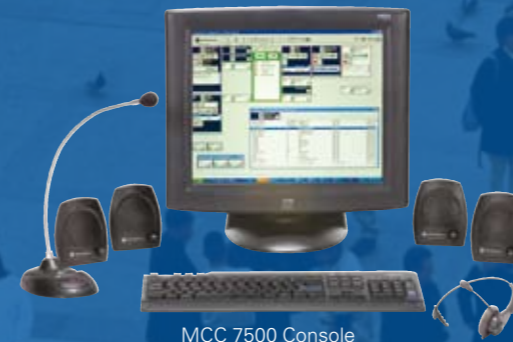
MCC 7500 Console