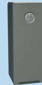
MTS4 Tetra BTS

To learn more about the MOTOA4 mission critical communications portfolio, visit us at www.motorola.com/TETRA today and experience Technology that's Second Nature™.