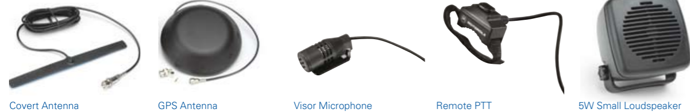
Examples of accessories

Surveillance operations vary considerably and the equipment for communication must be flexible, rugged, and ready to go at a moments notice. Officers already in the field may be called upon to participate at short notice in surveillance duties, whilst others have time to prepare. Accessories which help to conceal conventional radios will help officers to join surveillance operations at short notice. Vehicle mounting kits can be used in unmarked cars, vans or motorcycles. Motorola has a constantly expanding range of accessories for use with both conventional radios such as the MTP850 handheld and the MTM800E mobile radios. In addition the TCR1000 Discreet Covert radio has been introduced with a full range of antenna, power, and concealment accessories to enhance its flexibility for surveillance operations.