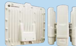
Point to Point Technology