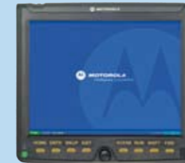
MW810 (12" Screen)