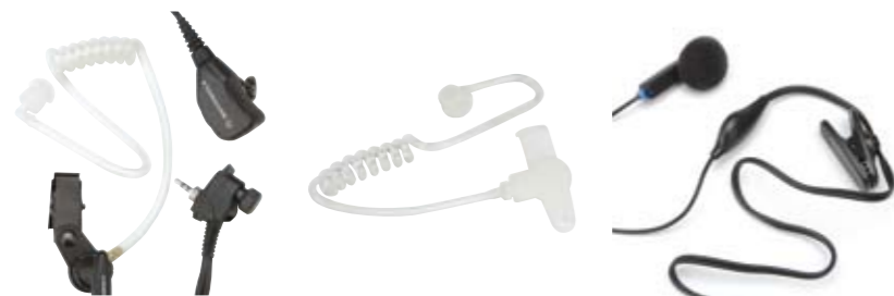
Examples of surveillance accessories

Discrete options are available for motorcycle officers as well. Remote mounting kits allow the officer to store the base of the unit easily in a secure trunk on the back of the motorcycle. Officers are equipped with discrete fist size microphones and can communicate easily and securely.